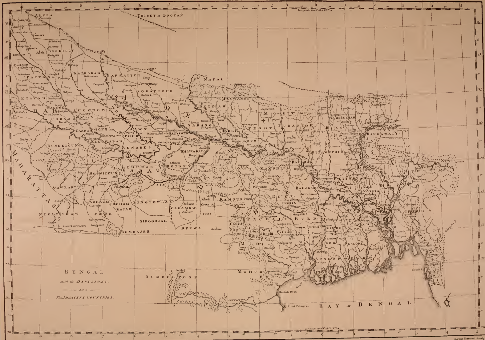
From Orme's "History of the Military Transactions in Hindostan." (Fourth Edition, 1801). Rep. by O.S. in 1880.